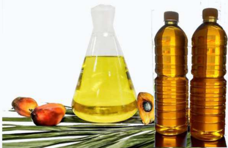
Palm oil derivative products

We have products that our consumers need.