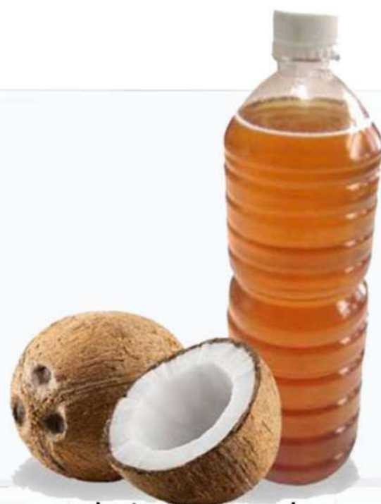
Coconut derivative products